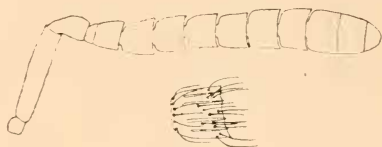
FIG. 3.—Antenna of female.